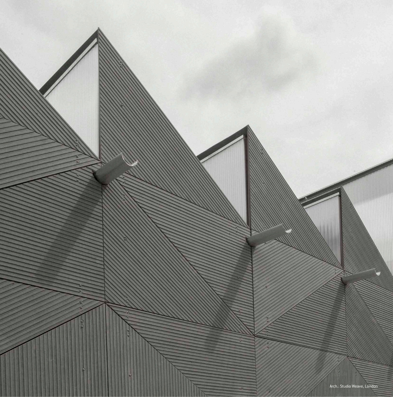
Arch.: Studio Weave, London

the nature of things the nature of things